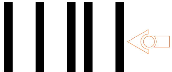
Light following (follow a torch/flashlight)