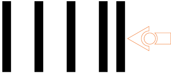
Clap controlled driving