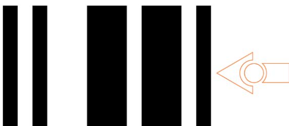
Bounce in borders