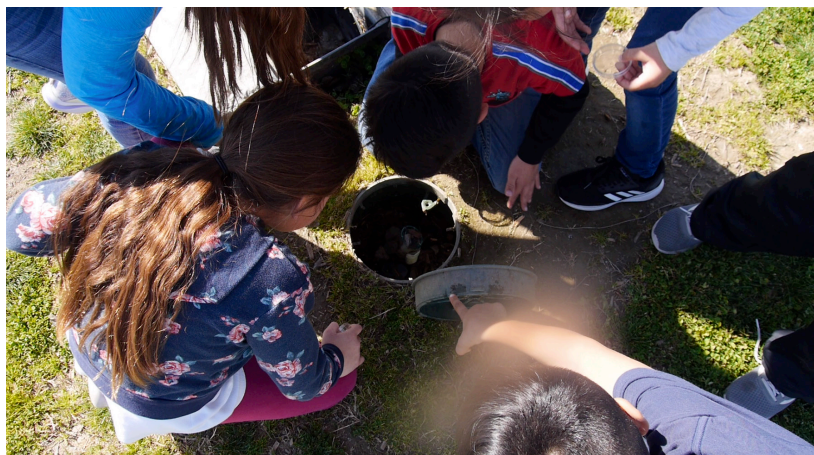
Use a map to find the hidden treasure!