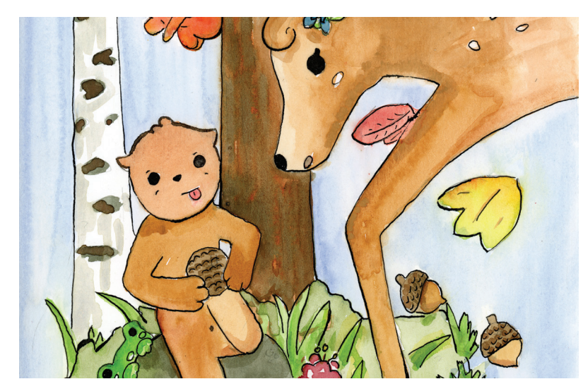
Remi had sore feet. So, Deer helped him make shoes that were neat!