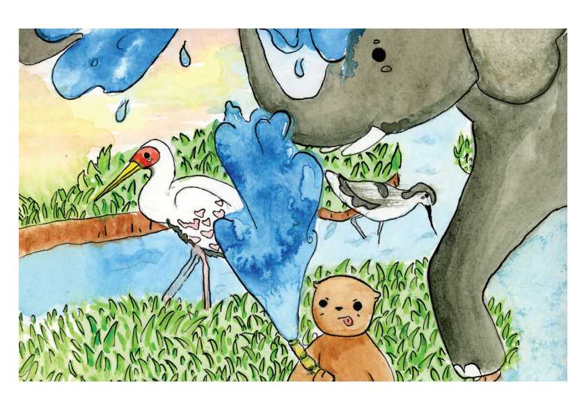
Remi saw the Elephant's spray. He said, "Hey, me too! I want to play!"