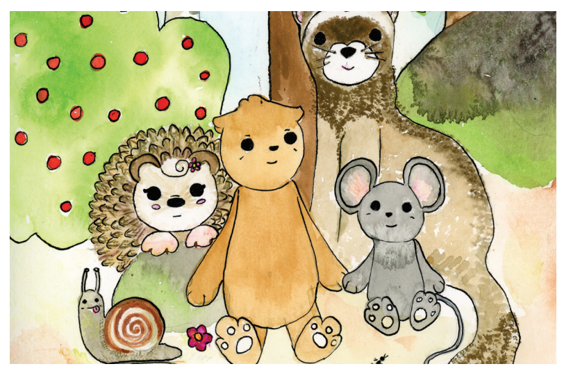
All the animals liked Remi. Remi liked the animals too.