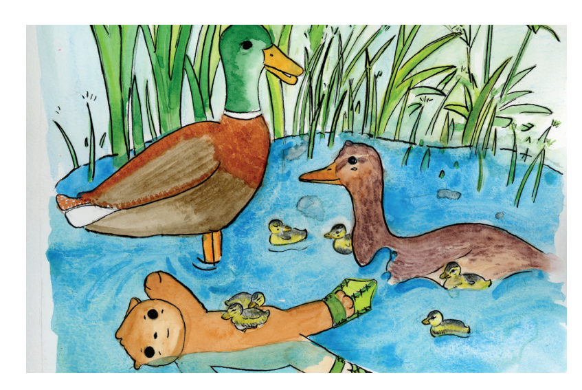
"Swimming is fun," said the ducks on the lake. What do you think Remi will make?