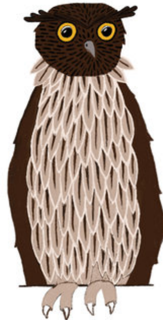
Brown Fish Owl