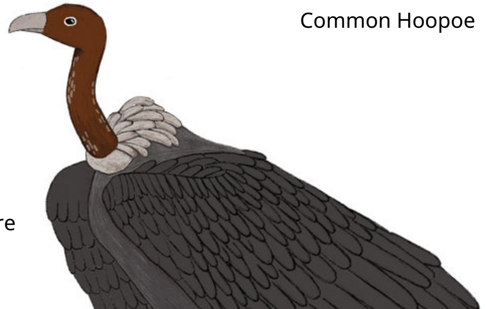
Indian Grey Vulture