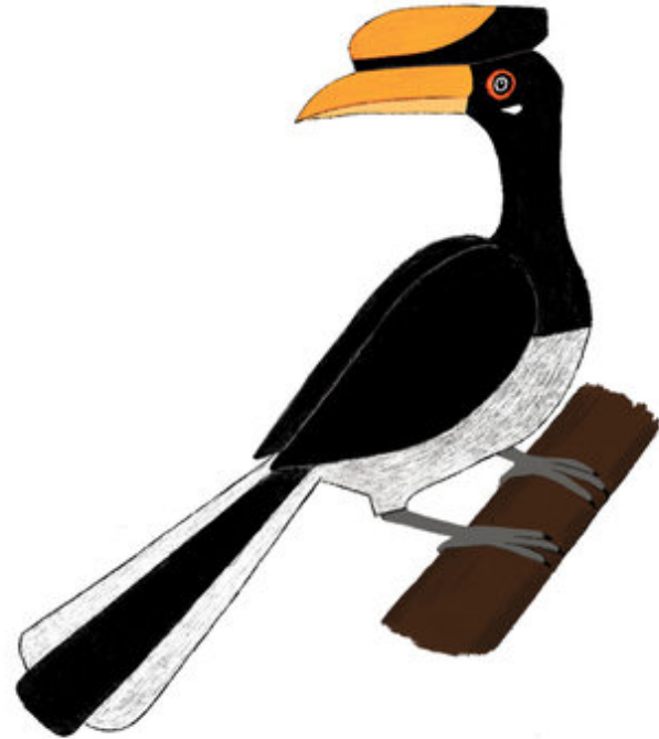
Great Indian Hornbill